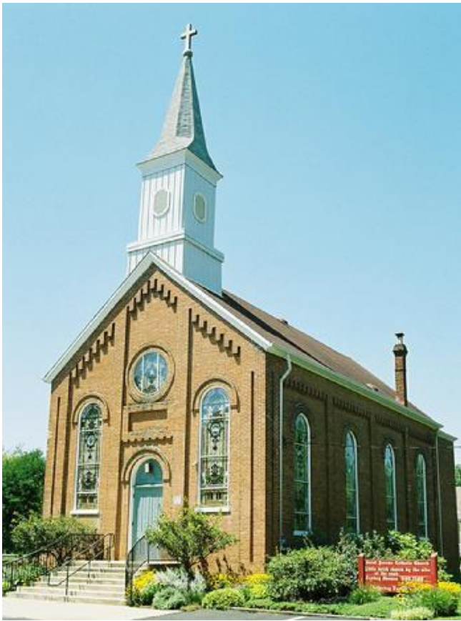
131 Rohde Street