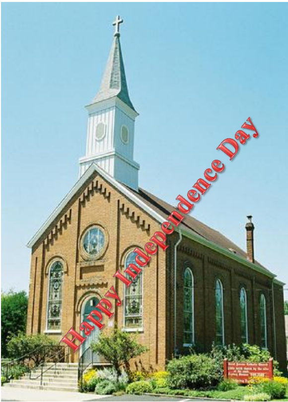
131 Rohde Avenue